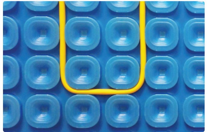
195W/m 2 at 2 dimple spacing